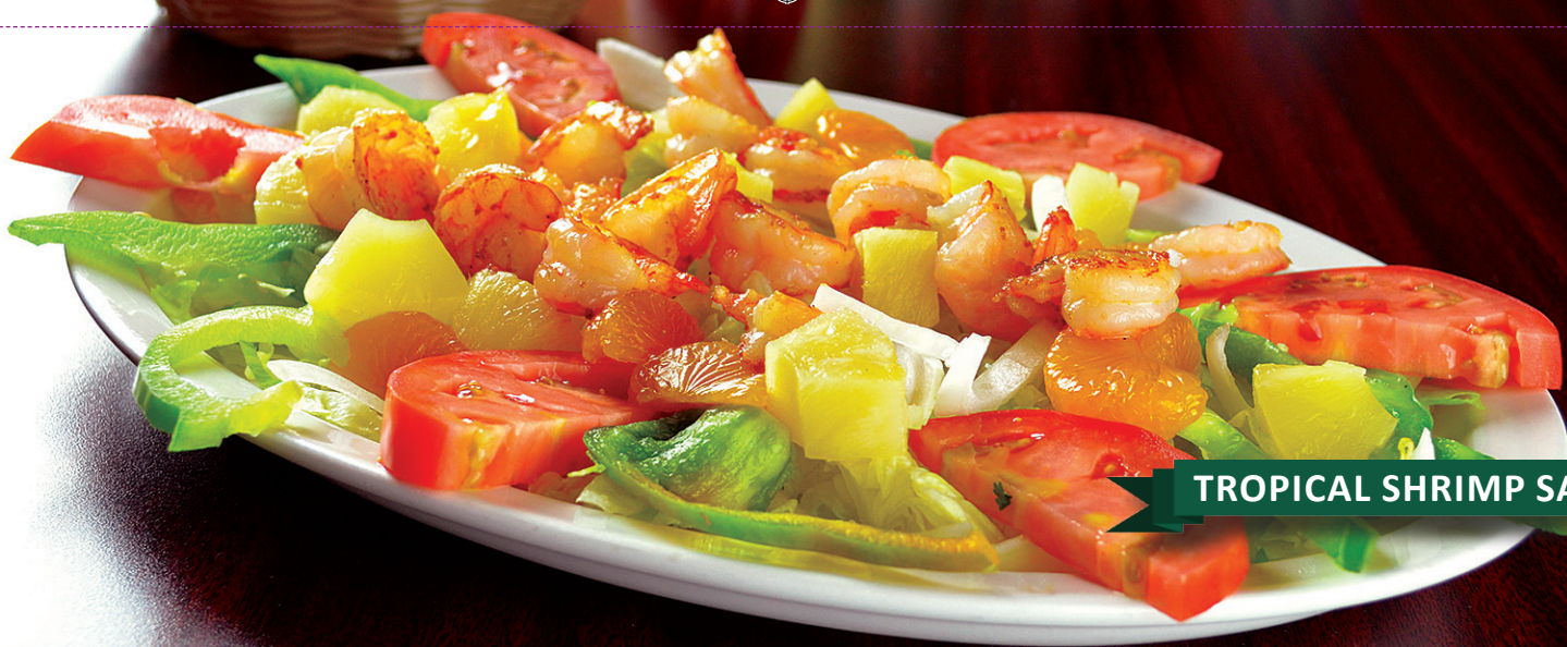
TROPICAL SHRIMP SALAD