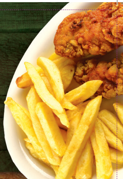
CHICKEN NUGGETS & FRIES